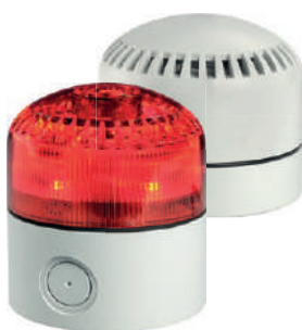
SIR-E S / SIR-E LED