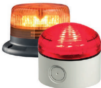
EVOLUX / XLF S

Approved beacon / Multifunctional LED beacon